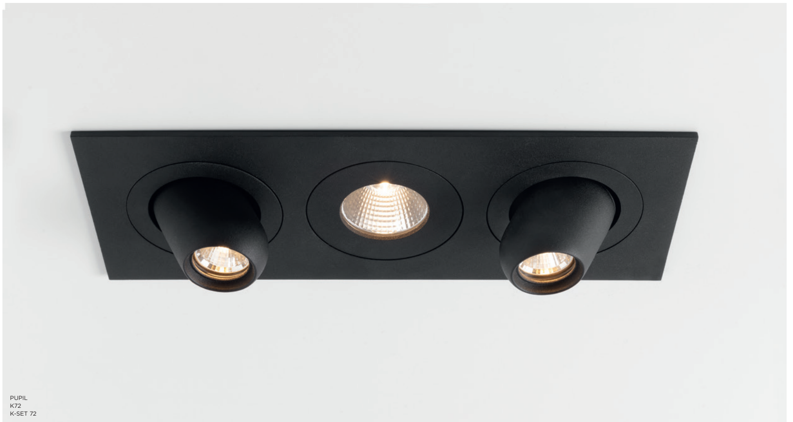
PUPIL K72 K-SET 72