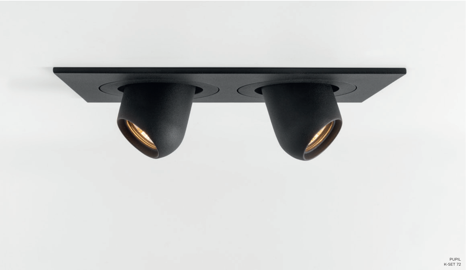
PUPIL K-SET 72