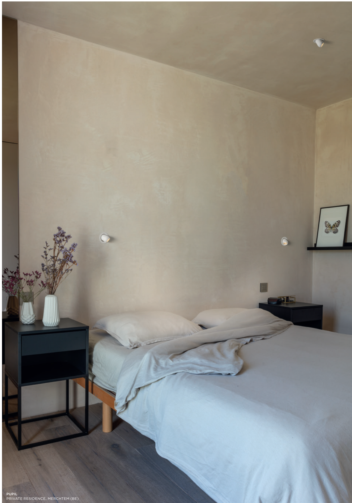
PUPIL PRIVATE RESIDENCE, MERCHTEM (BE)