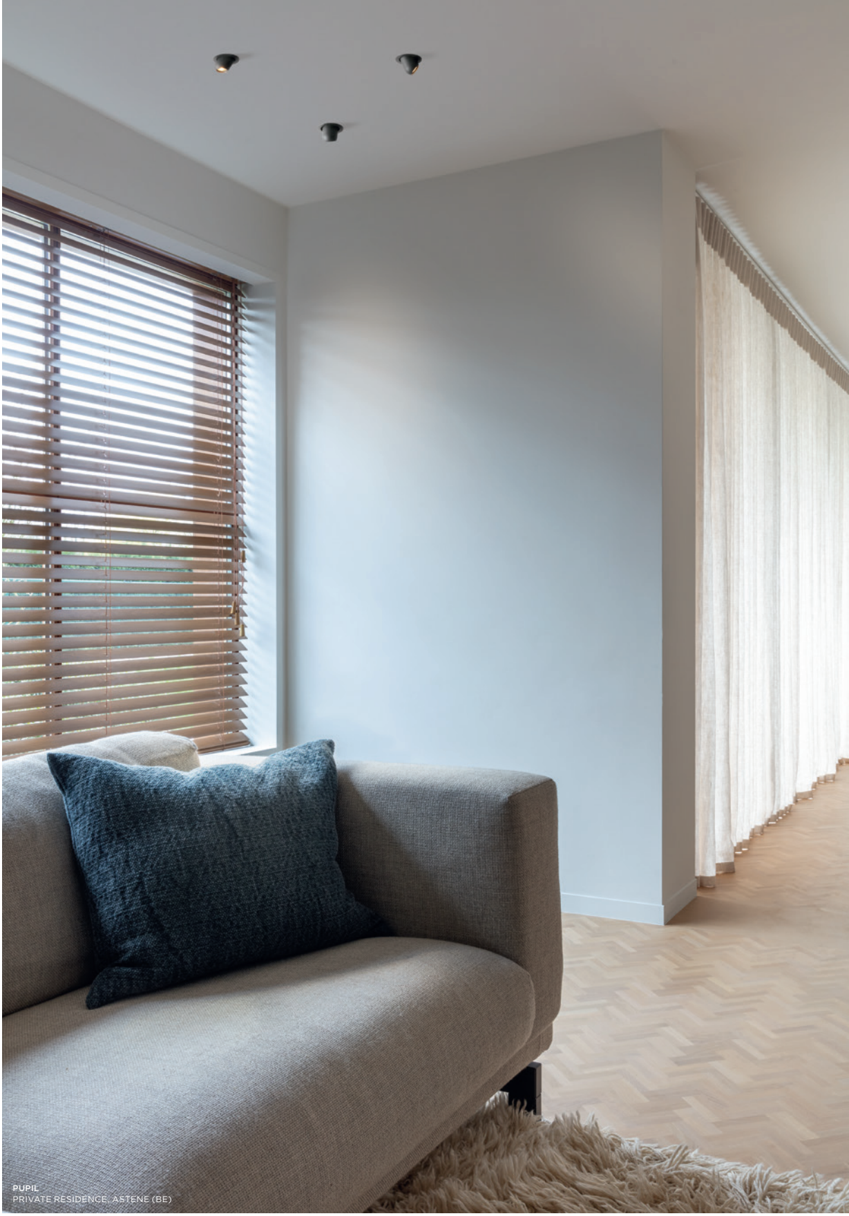
PUPIL PRIVATE RESIDENCE, ASTENE (BE)