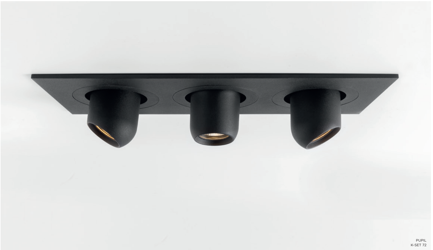
PUPIL K-SET 72