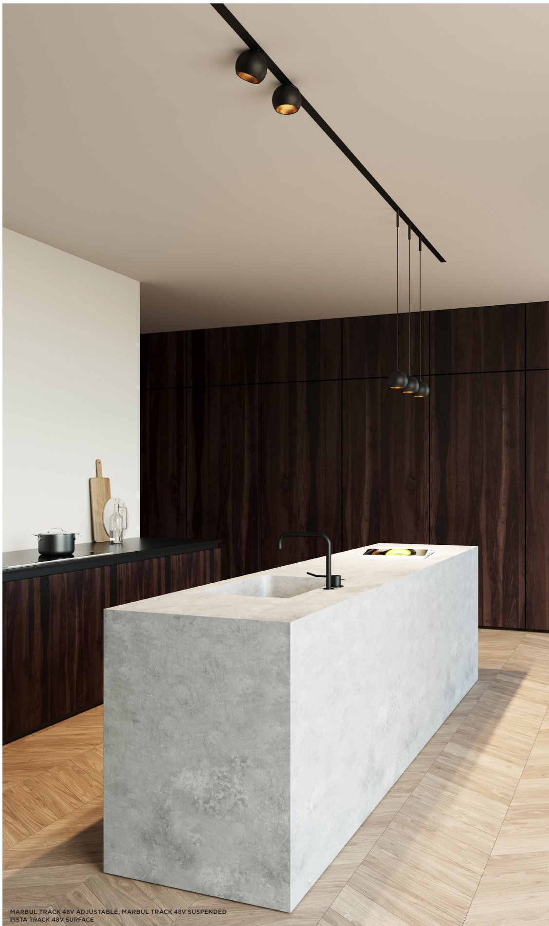
MARBUL TRACK 48V ADJUSTABLE, MARBUL TRACK 48V SUSPENDED PISTA TRACK 48V SURFACE