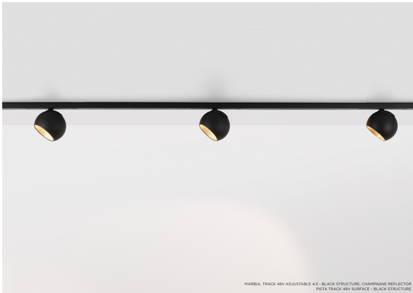
MARBUL TRACK 48V ADJUSTABLE 4.5 - BLACK STRUCTURE, CHAMPAGNE REFLECTOR PISTA TRACK 48V SURFACE - BLACK STRUCTURE