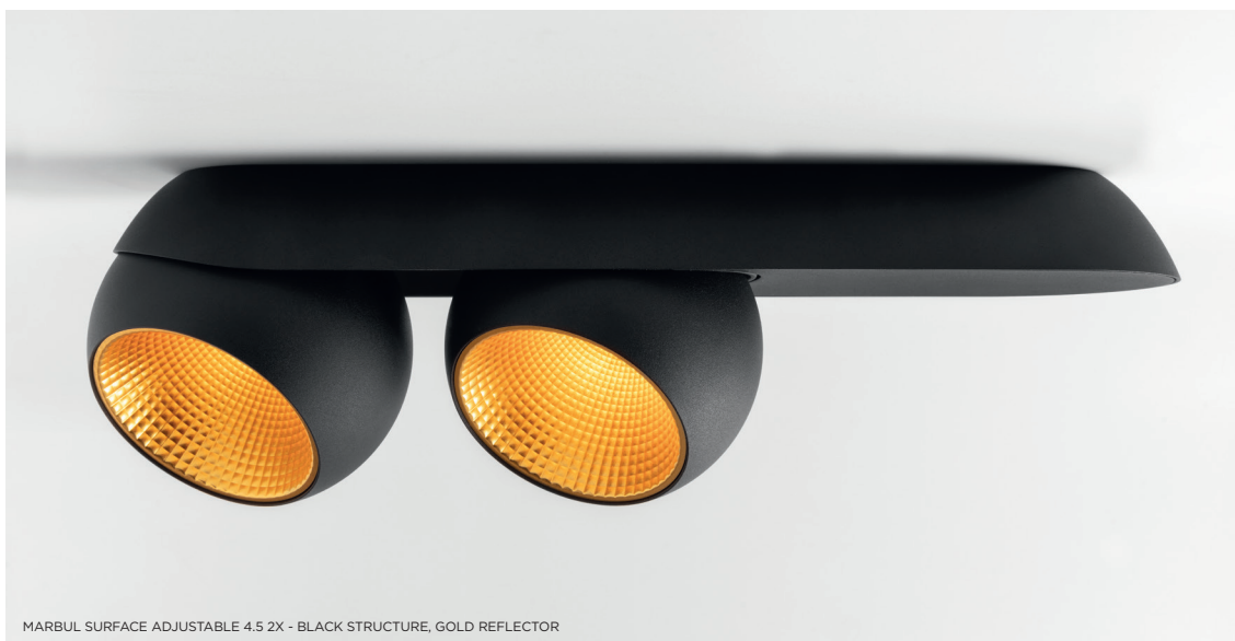
MARBUL SURFACE ADJUSTABLE 4.5 2X - BLACK STRUCTURE, GOLD REFLECTOR