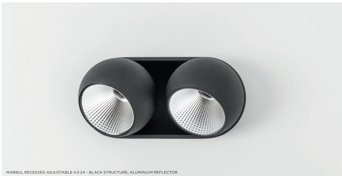
MARBUL RECESSED ADJUSTABLE 4.5 2X - BLACK STRUCTURE, ALUMINIUM REFLECTOR