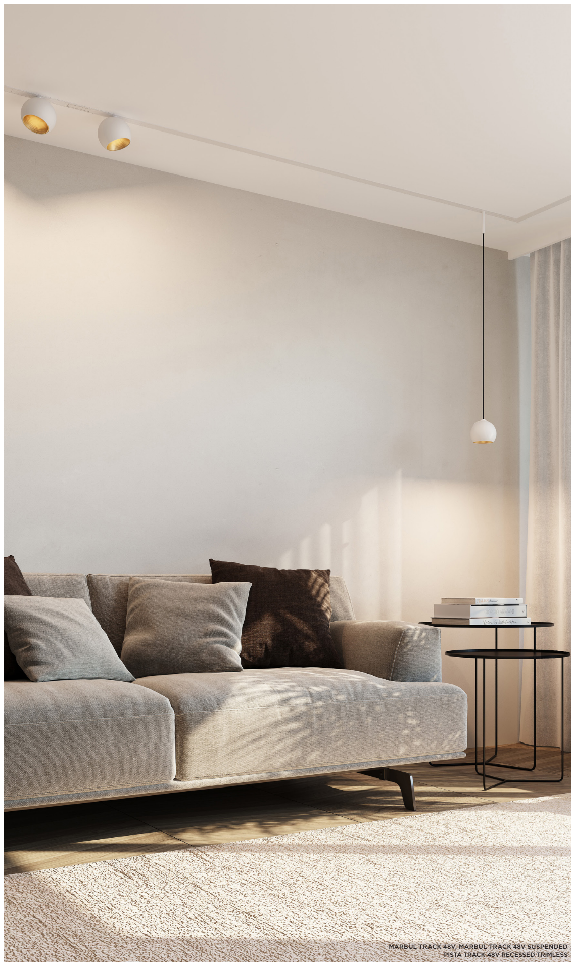
MARBUL TRACK 48V, MARBUL TRACK 48V SUSPENDED PISTA TRACK 48V RECESSED TRIMLESS