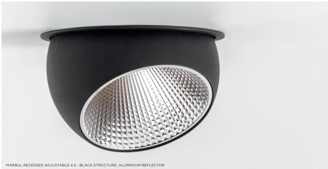
MARBUL RECESSED ADJUSTABLE 4.5 - BLACK STRUCTURE, ALUMINIUM REFLECTOR