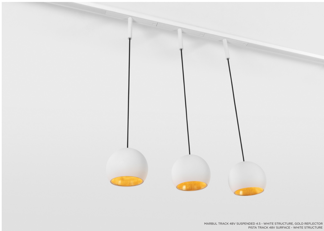
MARBUL TRACK 48V SUSPENDED 4.5 - WHITE STRUCTURE, GOLD REFLECTOR PISTA TRACK 48V SURFACE - WHITE STRUCTURE