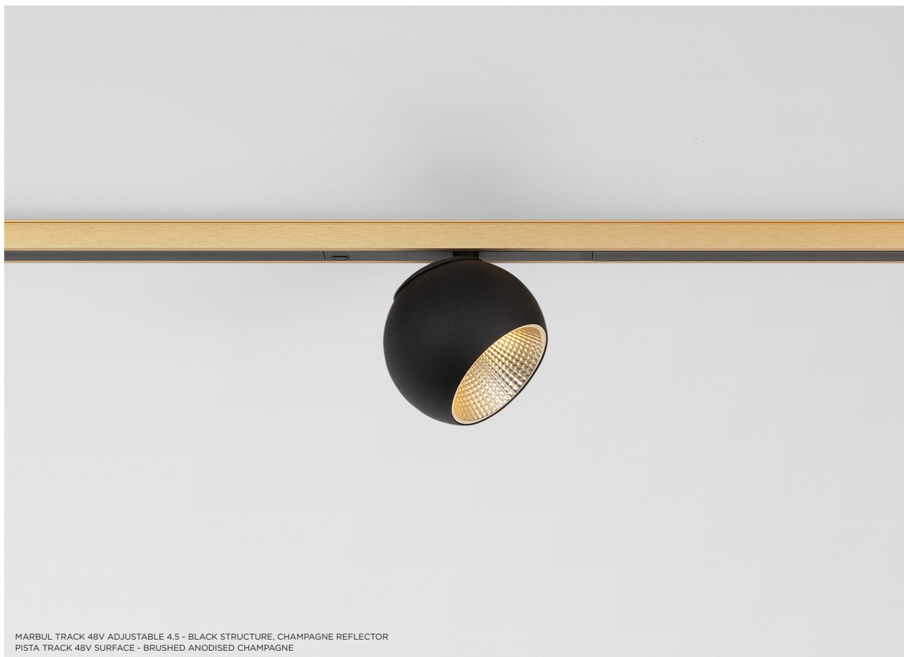
MARBUL TRACK 48V ADJUSTABLE 4.5 - BLACK STRUCTURE, CHAMPAGNE REFLECTOR PISTA TRACK 48V SURFACE - BRUSHED ANODISED CHAMPAGNE