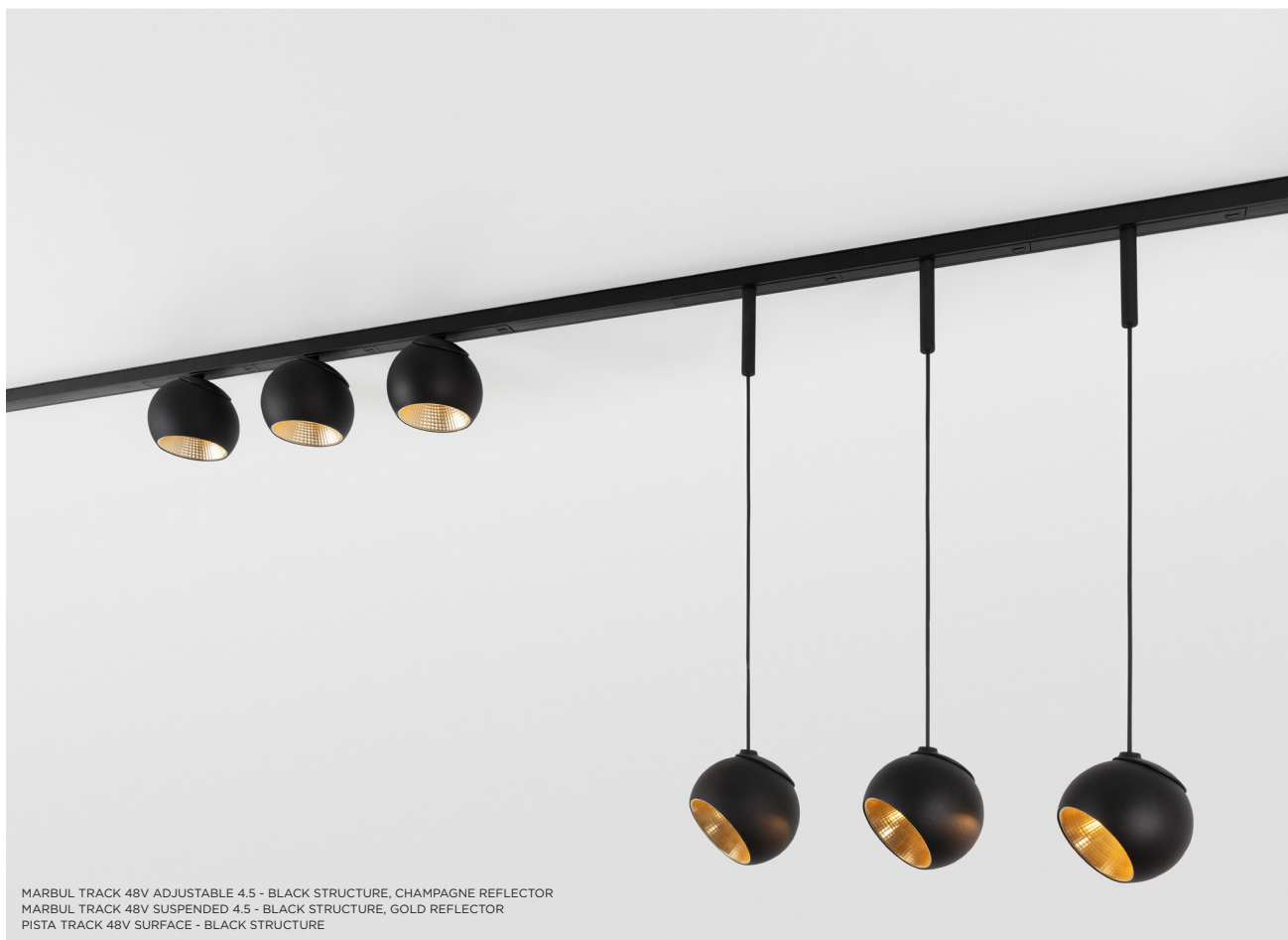
MARBUL TRACK 48V ADJUSTABLE 4.5 - BLACK STRUCTURE, CHAMPAGNE REFLECTOR MARBUL TRACK 48V SUSPENDED 4.5 - BLACK STRUCTURE, GOLD REFLECTOR PISTA TRACK 48V SURFACE - BLACK STRUCTURE