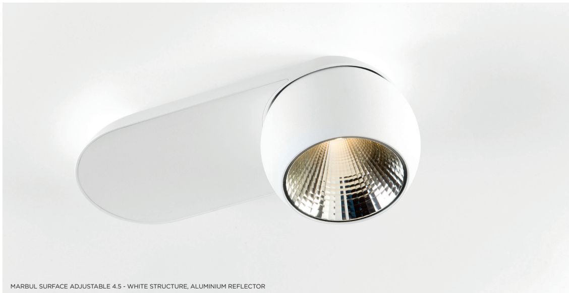
MARBUL SURFACE ADJUSTABLE 4.5 - WHITE STRUCTURE, ALUMINIUM REFLECTOR