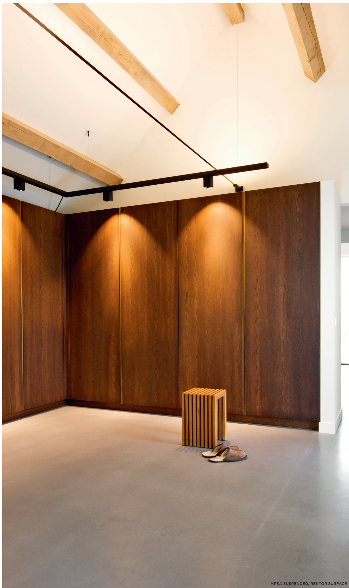
MP3.1 SUSPENDED, REKTOR SURFACE