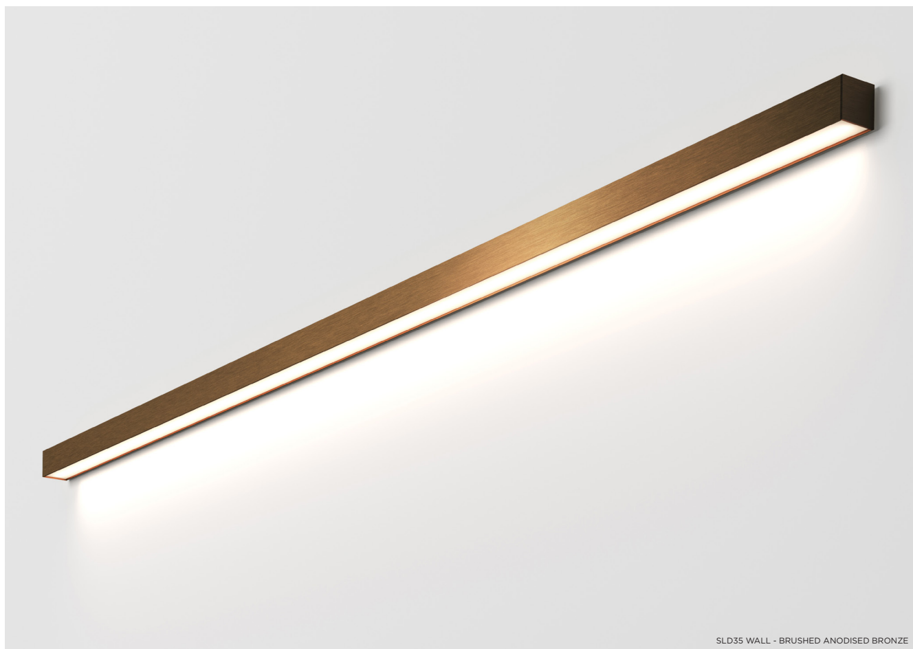
SLD35 WALL - BRUSHED ANODISED BRONZE