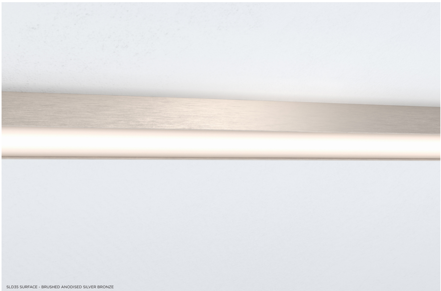
SLD35 SURFACE - BRUSHED ANODISED SILVER BRONZE