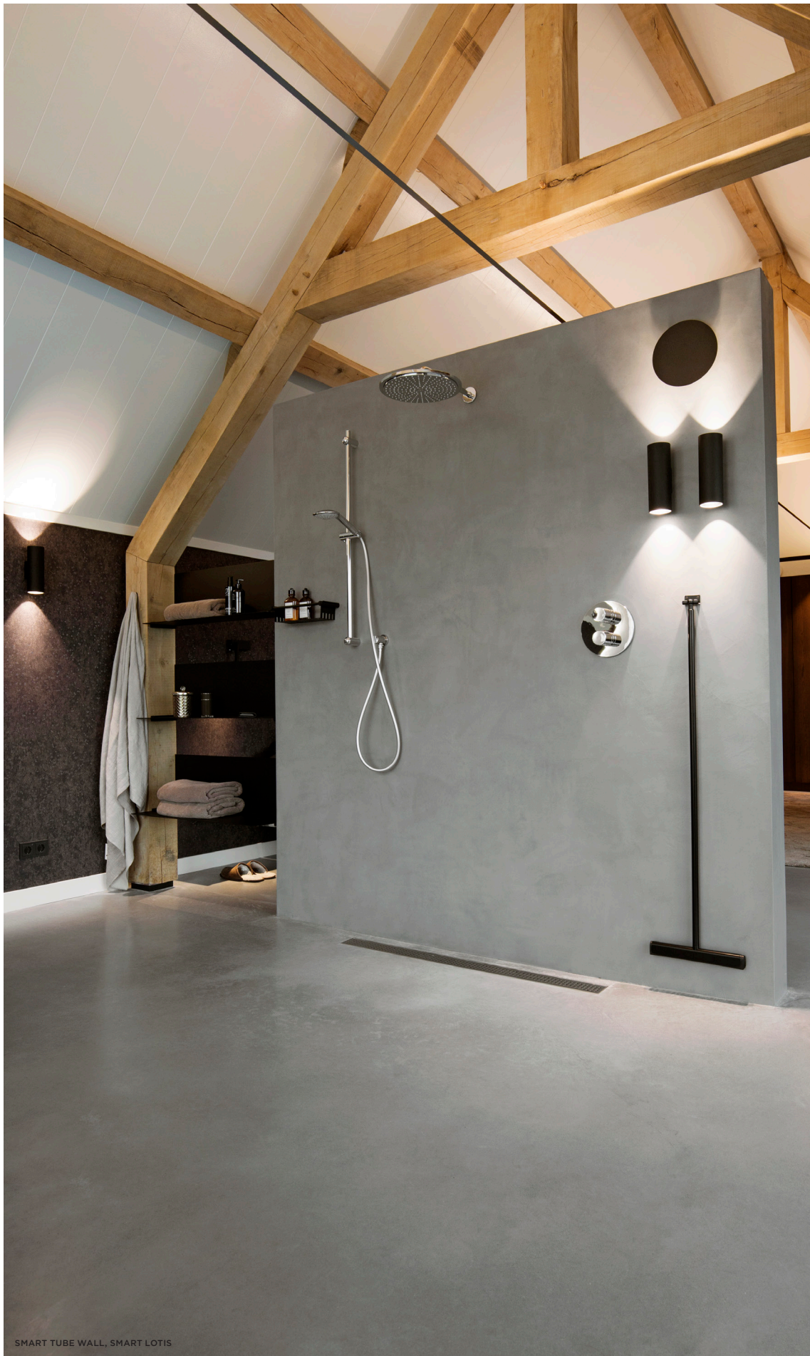
SMART TUBE WALL, SMART LOTIS