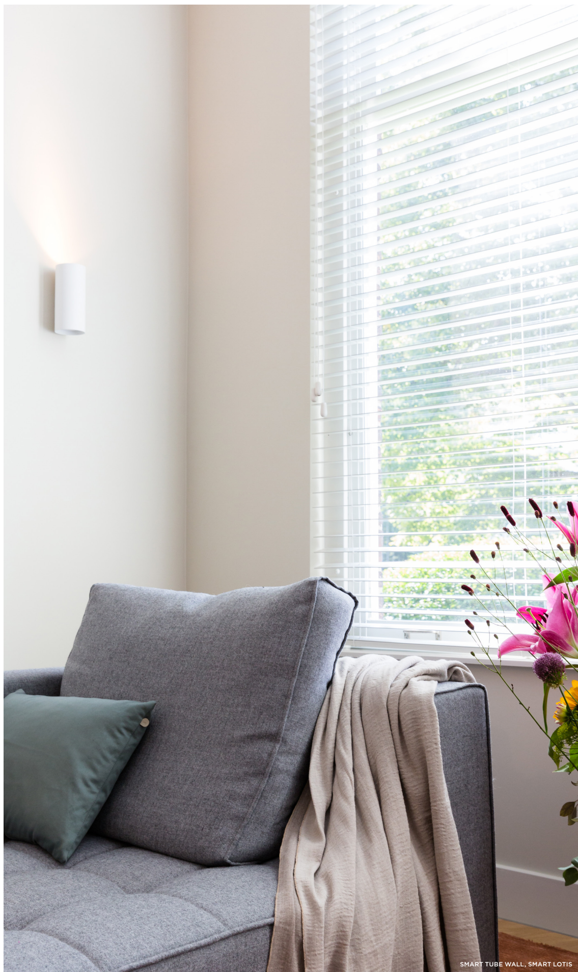
SMART TUBE WALL, SMART LOTIS